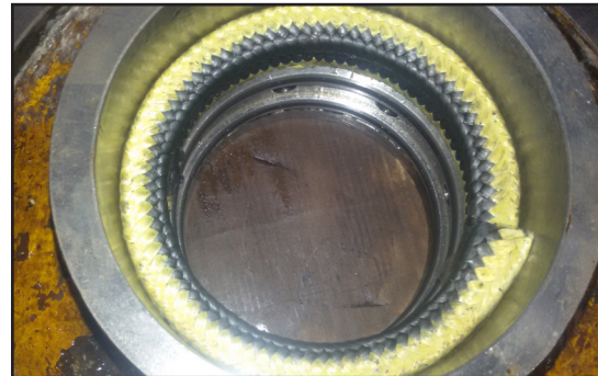
DualPac 2211 Packing installed. Note that middle rings are oriented with the aramid on the OD to create a tight seal that needs fewer adjustments.