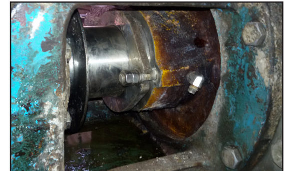
Client saved nearly $70K US each year.